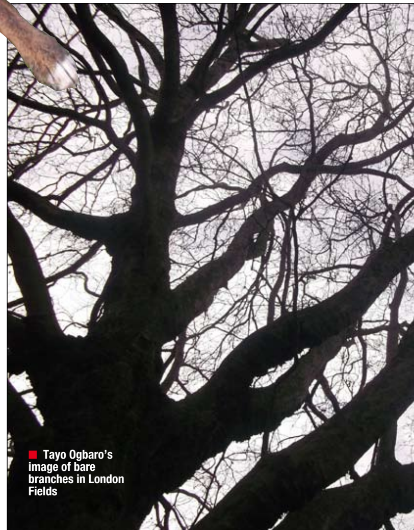
■ Tayo Ogbaro's image of bare branches in London Fields

Taylor focussed on food and culture, and said: “My pictures show restaurants, shop keepers and their owners after the breakfast rush.