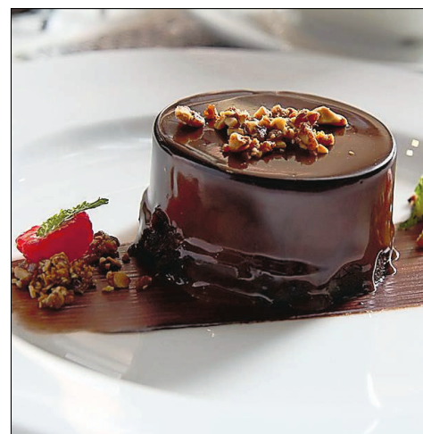
■ You could win a romantic Valentine's dinner for two

The Factory House is inspired by the excitement of the Victorian industrial age, when people were intrigued to experiment and innovate. The design of the restaurant and bar references the factory